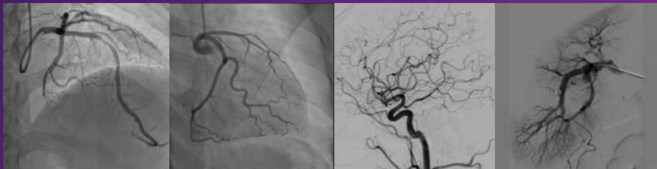
Courtesy of Clinique Pasteur, Toulouse, France and Ruby Hall Clinic, India